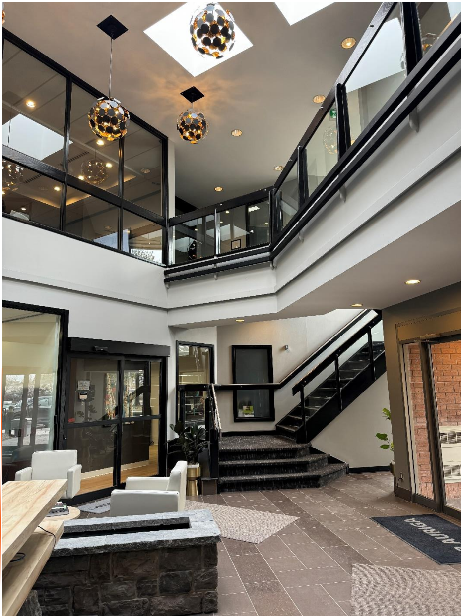
Front Door/Reception Area