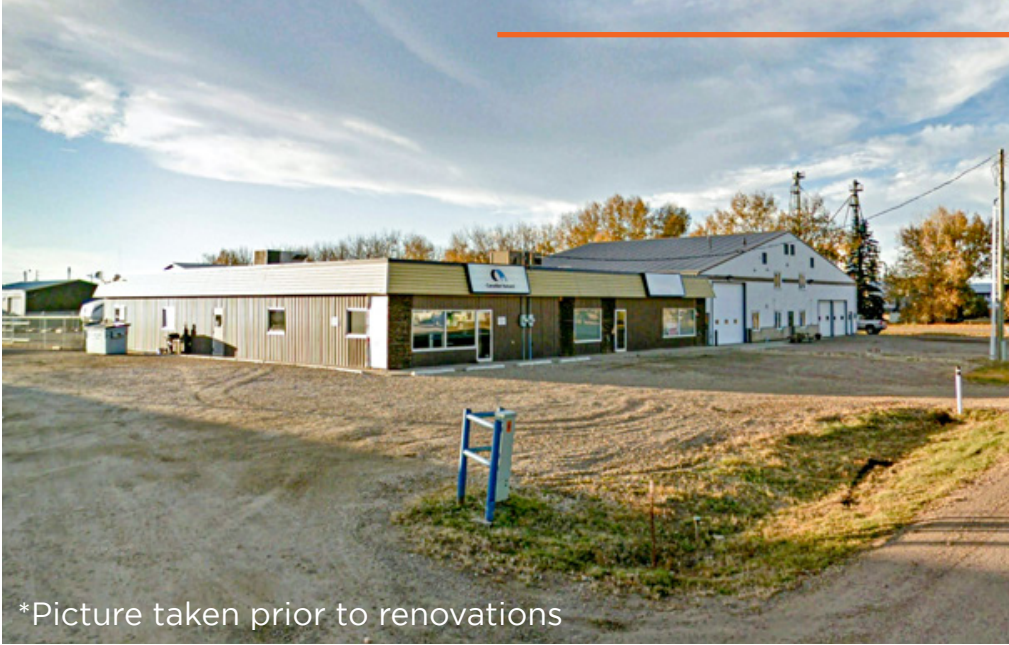
*Picture taken prior to renovations