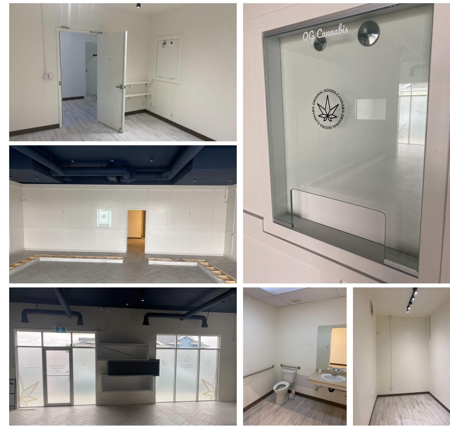
The above particulars are submitted to the best of our knowledge and are subject to change without notice. CDN GLOBAL ADVISORS LTD. does not assume responsibility for any errors or omissions.