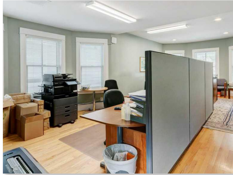
Features: // Office space