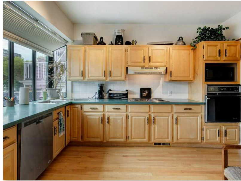
//Office space and kitchen